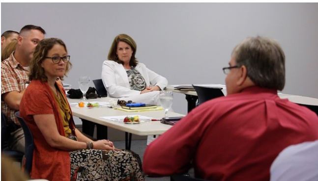
CJCC meeting in July 2016.

This group has been defining the specifications for the automatic court reminder technology for General Sessions Court and Charleston Municipal Court. The team is also reviewing additional ways to impact criminal bench warrants. Related training material and protocols are also under development.