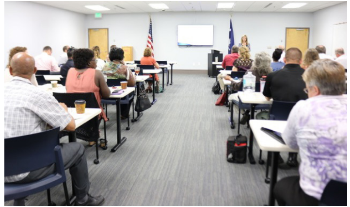
CJCC meeting in July 2016.

The City of Charleston Police Department and North Charleston Police Department have been piloting the use of cite and release practices on low-level offenses and have begun a quantitative and qualitative review of the pilots. The results will be used to inform development of the decision tool and related training.